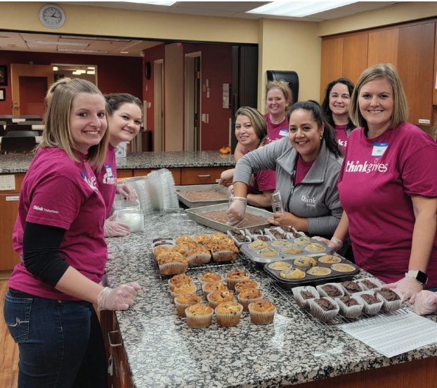
Working outside and inside on Think Gives Day