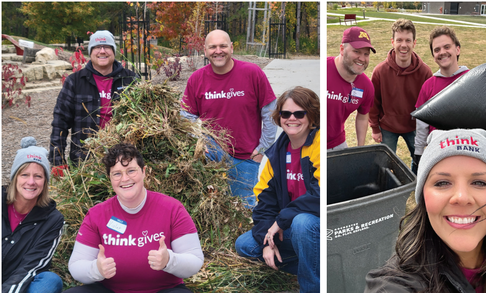
All in on Think Gives Day

This one-day event has become a beloved, highly-anticipated tradition among our employees and the organizations we help. In 2024, we closed our offices for a day to send our team out into the community to paint, clean, pack, move, rake, build, haul, and much more.