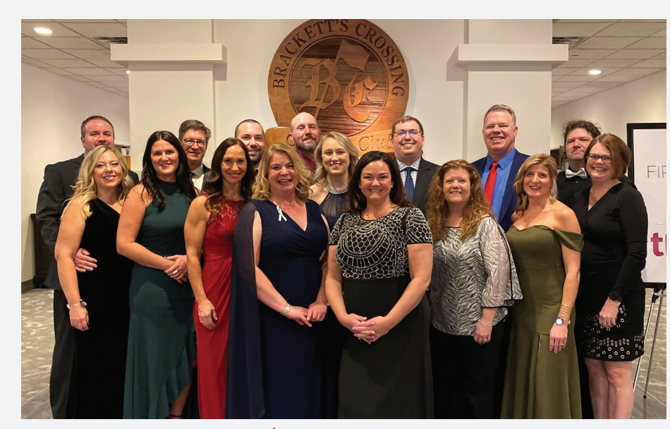
Benefiting 360 Communities